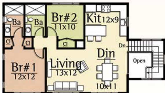
Upper Level 1,058 square feet

More than just a garage, the Elm Carriage House combines automobile storage and living into one compact design. The Elm features 2 bedrooms and 2 baths, and a 3 car garage. A large Living Room with exposed timbers and an open Kitchen / Dining Room complete a dramatic interior. Exterior timber, stone, and shingle detailing complete the feel of this perfect rustic getaway.