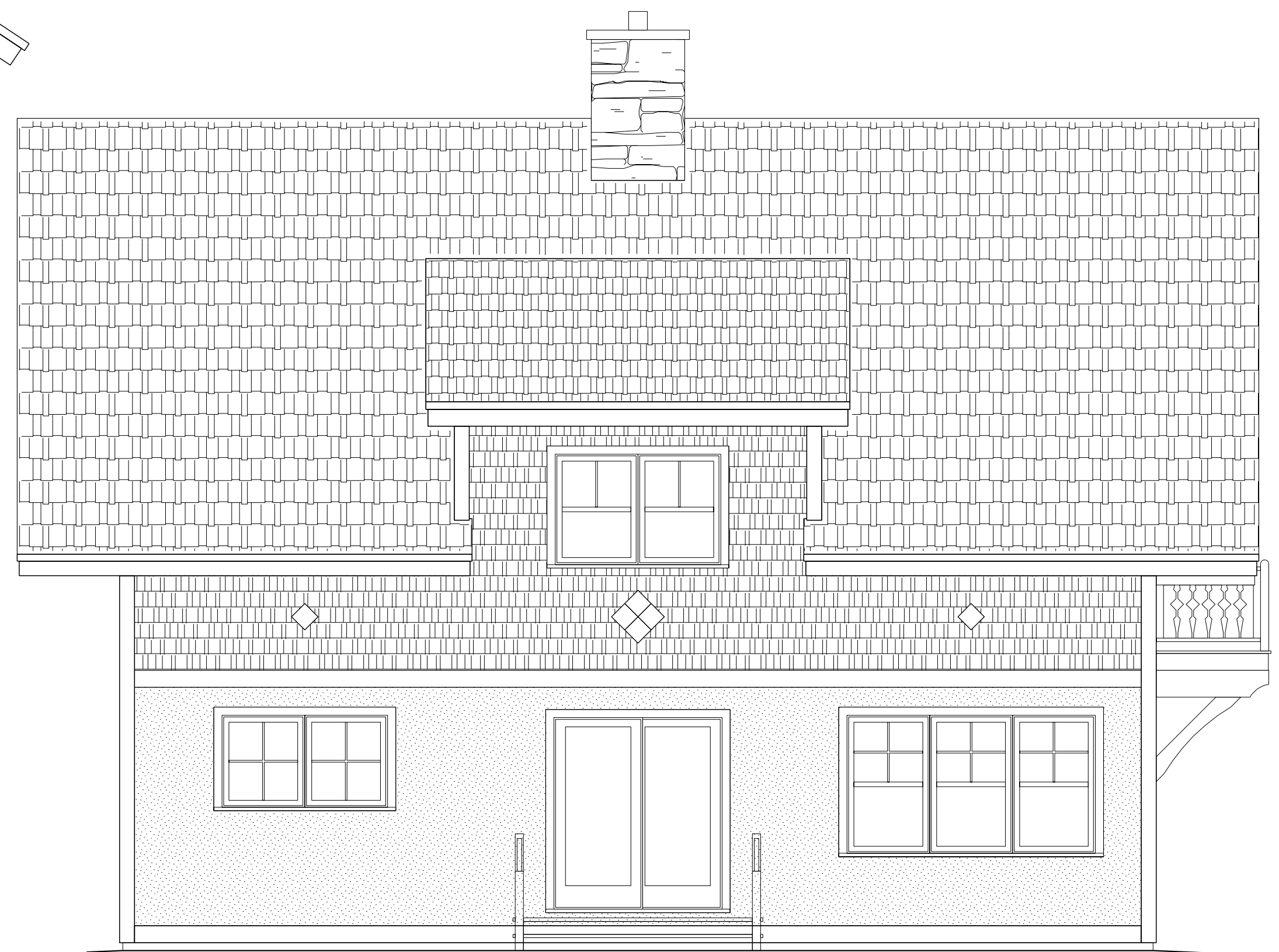
2 LEFT ELEVATION

CLASSIC CHALET 1 SQUARE FOOT PROFILE: 1st FLOOR = 1512sf 2nd FLOOR = 1512sf TOTAL = 3024sf TYPE OF FRAME: PRINCIPAL PURLIN WITH COMMON RAFTERS