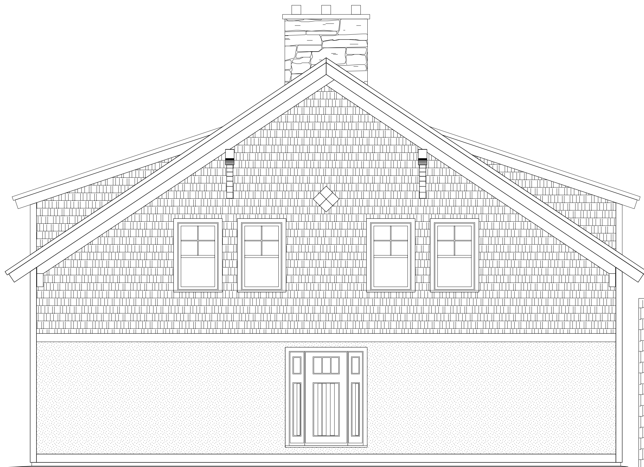
1 REAR ELEVATION